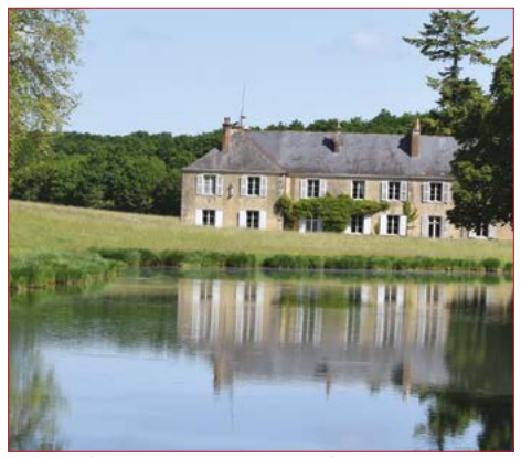
Potential new WCCM International Centre in France

When the world was going mad in the fourth century many went to the desert but not only to escape the world. In the twenty-first century we need places where people can also step aside even briefly from the whirling madness of the world to re-centre, reconnect to themselves and sustain their spiritual practice. One of the key